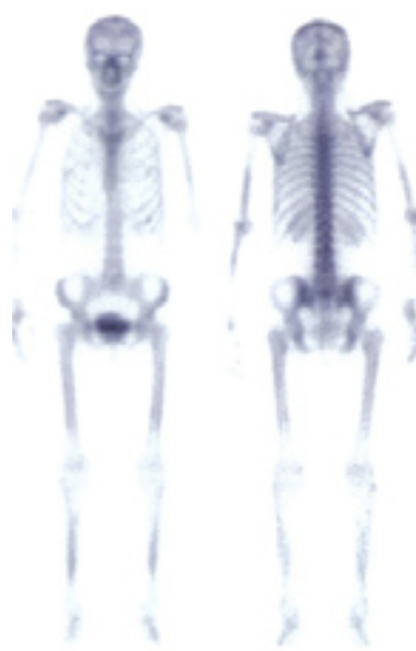
Figure 3. Anterior and posterior views of normal BS with 740MBq ^{99m}\text{Tc} -MDP in a patient with prostate cancer at the time of initial diagnosis.

In conclusion , serum PSA testing is currently recommended in symptomatic patients with known PC for disease staging and treatment monitoring and in asymptomatic selected population groups aged more than 50 years. It is reasonable to suggest that PSA density, velocity, doubling time and free to total PSA ratio or combining PSA with Gleason score shall greatly increase PSA specificity in detecting PC cases that need immediate attention and treatment. Radioisotopic bone scan by SPET or PET can demonstrate osseous metastases at later stages of PC, but should also be applied in cases that may have been falsely considered as at an early stage of PC for better staging and for periodic follow-up of the disease.