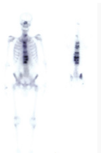
Figure 4. Bone scan with 740MBq ^{99m}\text{Tc} -MDP in the anterior and posterior projection, in a patient with newly diagnosed PC. Multiple, diffuse osteoblastic metastases are seen along the spine and in the right sacroiliac joint.

Furthermore, falsely low PSA values are usually observed in patients with advanced PC treated with docetaxel and estramustine or mitoxantrone and prednisolone [35]. It is worth mentioning that in these cases the false positive values of PSA refer to 40% of treated patients. Four to six weeks after radical prostatectomy the value of PSA should be <0.1\text{ng/mL} . If these values remain stable or even better, undetectable for 5 years postoperatively, the risk of PC relapse is minimum. If at 6 months PSA is increased, then we have recurrence or metastases [59, 60].